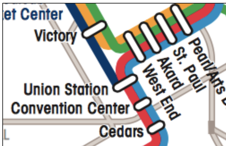
Photo of DART rail stations

El Centro Community College can be accessed from DART Rail's WEST END STATION . The West End Station is two stops (6 minute ride) away from the Convention Center.